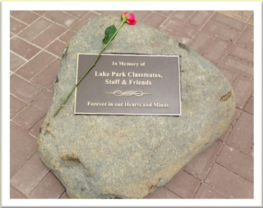
The Memorial Garden is located near the auditorium entrance at Lake Park's West Campus.